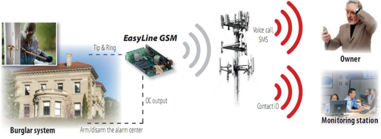
Figure 1: Device operation

The output can function in monostable mode so it will draw for a certain time than it will release. Output can be loaded with 300 mA maximum and it can handle a voltage of 30V maximum.